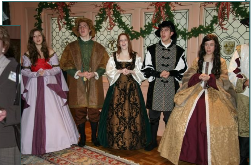
The Madrigal Group from Pius XI High School performed in authentic costumes. Here are five of the 11 young people who entertained with beautiful music, including ensemble and solo performances.